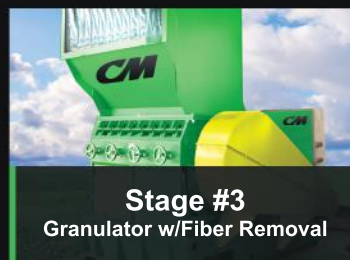
Stage #3 Granulator w/Fiber Removal