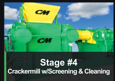
Stage #4 Crackermill w/Screening & Cleaning