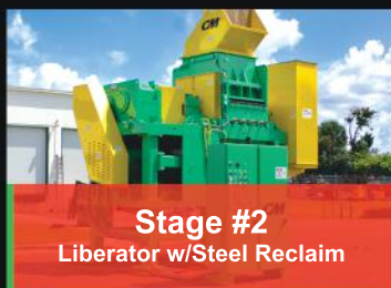
Stage #2 Liberator w/Steel Reclaim